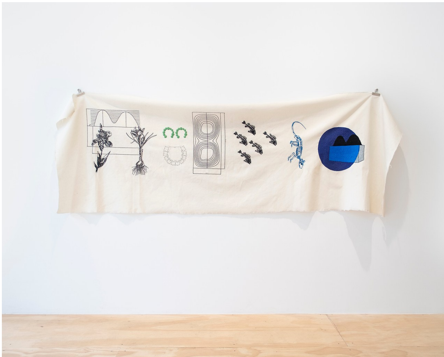
Marwa Arsanios Untitled (Tapestry 2) , 2020 Hand-embroidered cotton on linen 79 inches x 24 inches