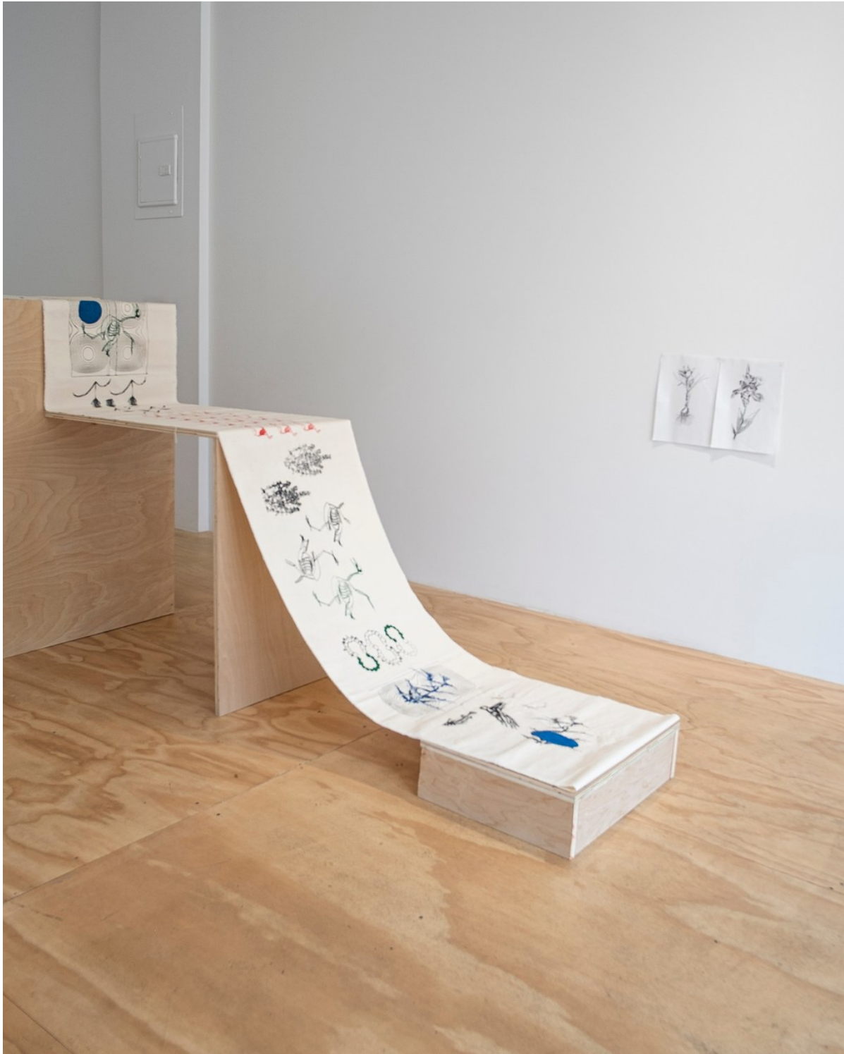
Marwa Arsanios Untitled (Tapestry) , 2019 Silkscreen on linen 134 inches x 20 inches