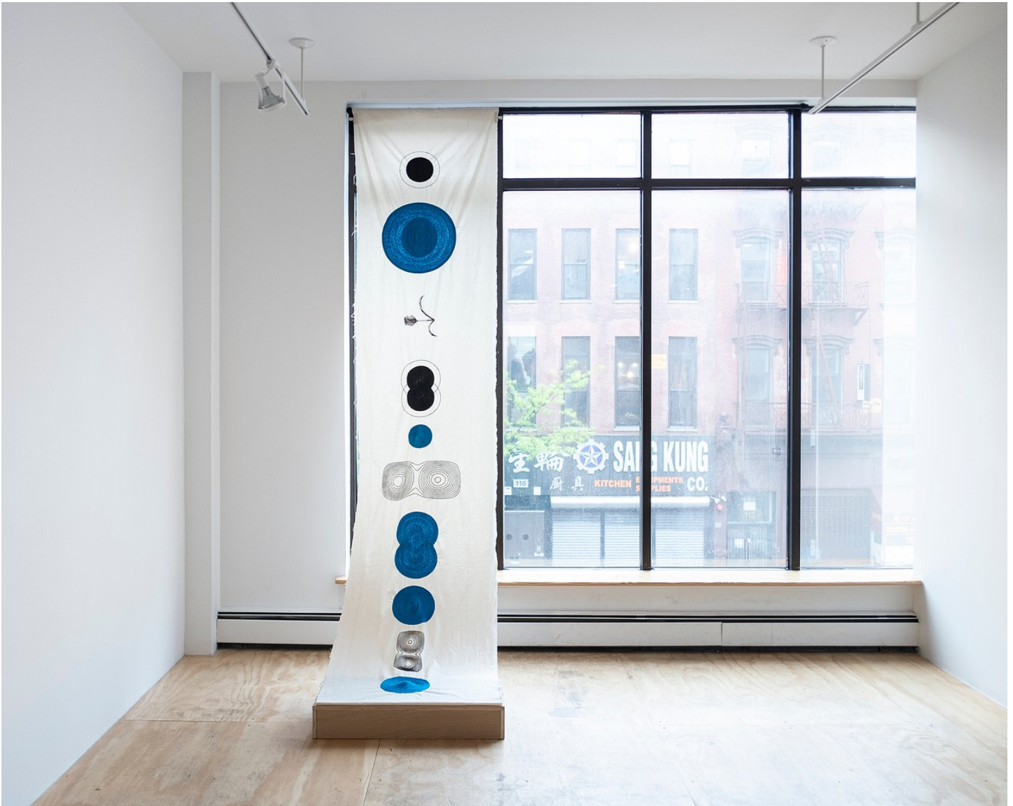
Marwa Arsanios Untitled (Tapestry 4) , 2020 Hand-embroidered cotton on linen 157 inches x 24 inches