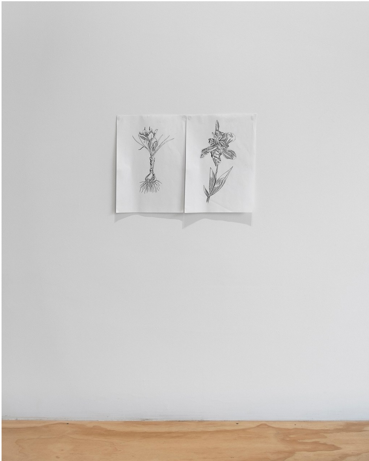
Marwa Arsanios Sketches for the tapestry, 2017 Pen on paper 8.3 inches x 11.7 inches