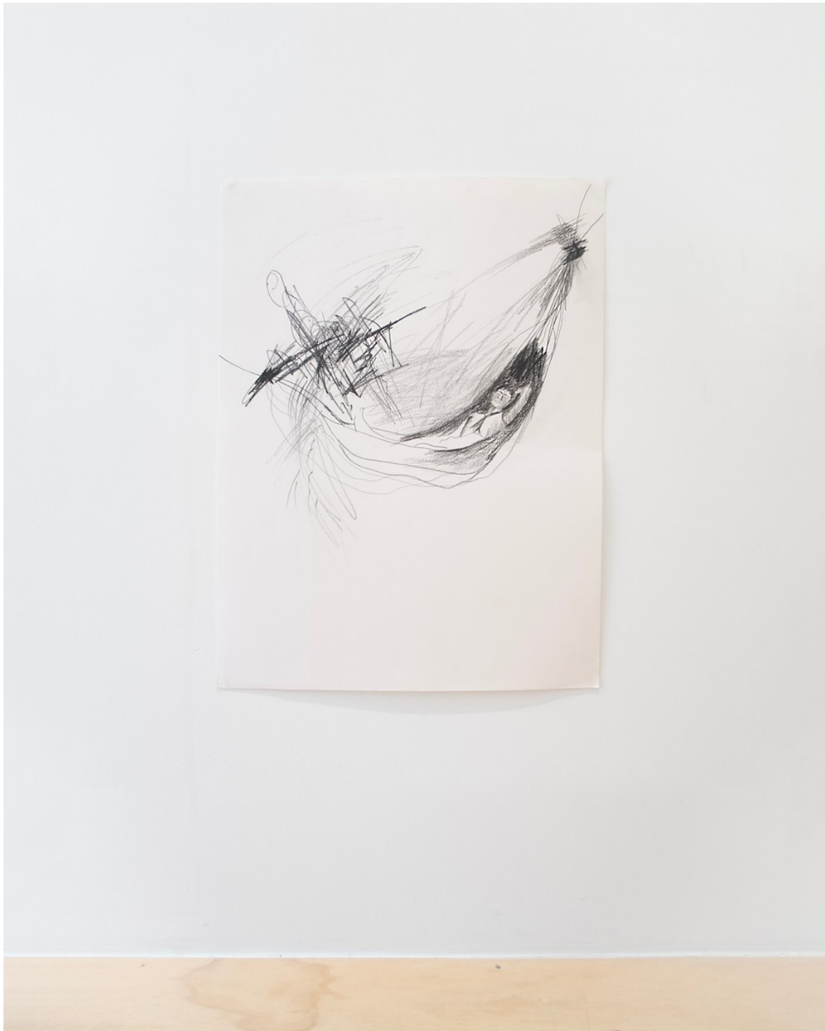
Marwa Arsanios Westhope House , 2007 Charcoal and pencil on paper 16.5 inches x 23 inches