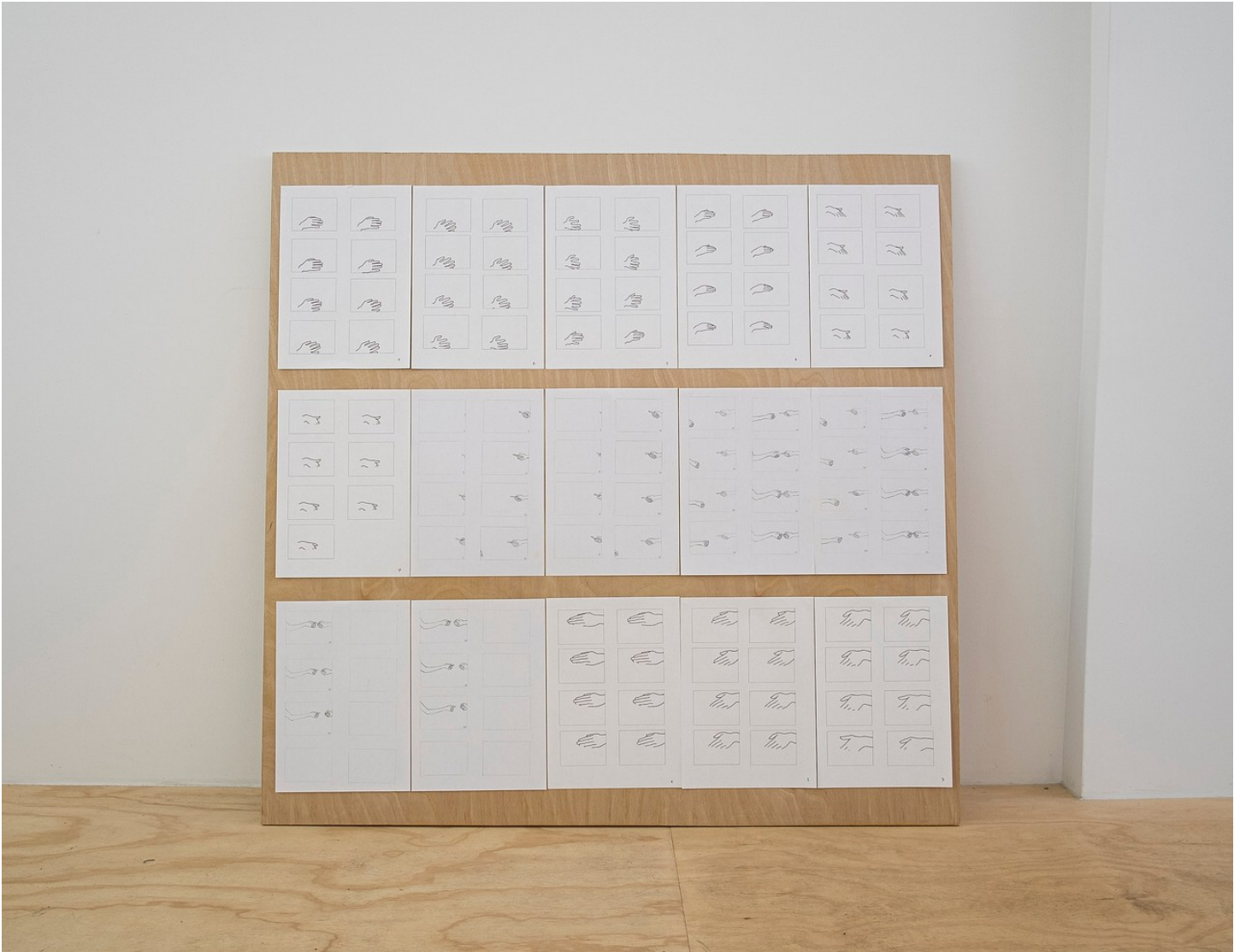
Marwa Arsanios Studies of a movement , 2007 Pen and pencil on paper 8.3 inches x 11.7 inches (each)