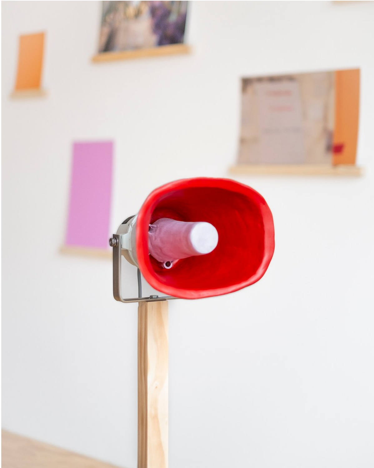
Joe Namy A Siren Sung Six Different Ways , 2023 siren, clay, acrylic paint, amplifier Sound: 2:13, 12 x 12 inches