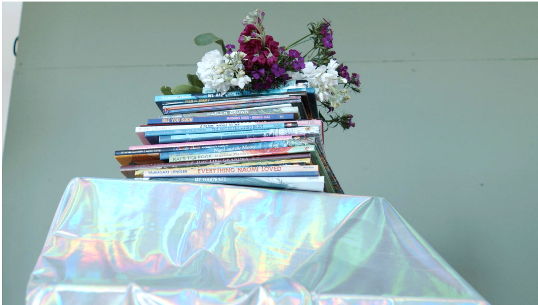
Studies for a Library , 2023. Single channel video installation. Color, sound, 5'00"

Brief Histories presents Studies for a Library , an exhibition by Joe Namy, opening on Saturday, September 16, and on view through October 28, 2023. In Studies for a Library , Namy explores the transformation of grief and the coping methods of survivors through a body of work that includes a video installation, photographs, selection of books, and a sound sculpture. Together, these elements map the library as a space where memorial, healing, and regeneration intersect.