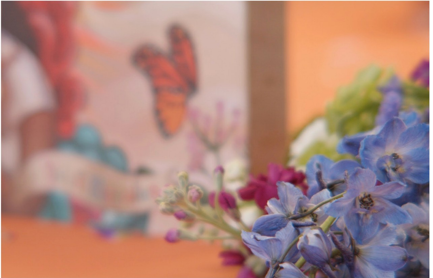
Joe Namy Butterfly , 2023 Digital C-Print 20 x 13 inches