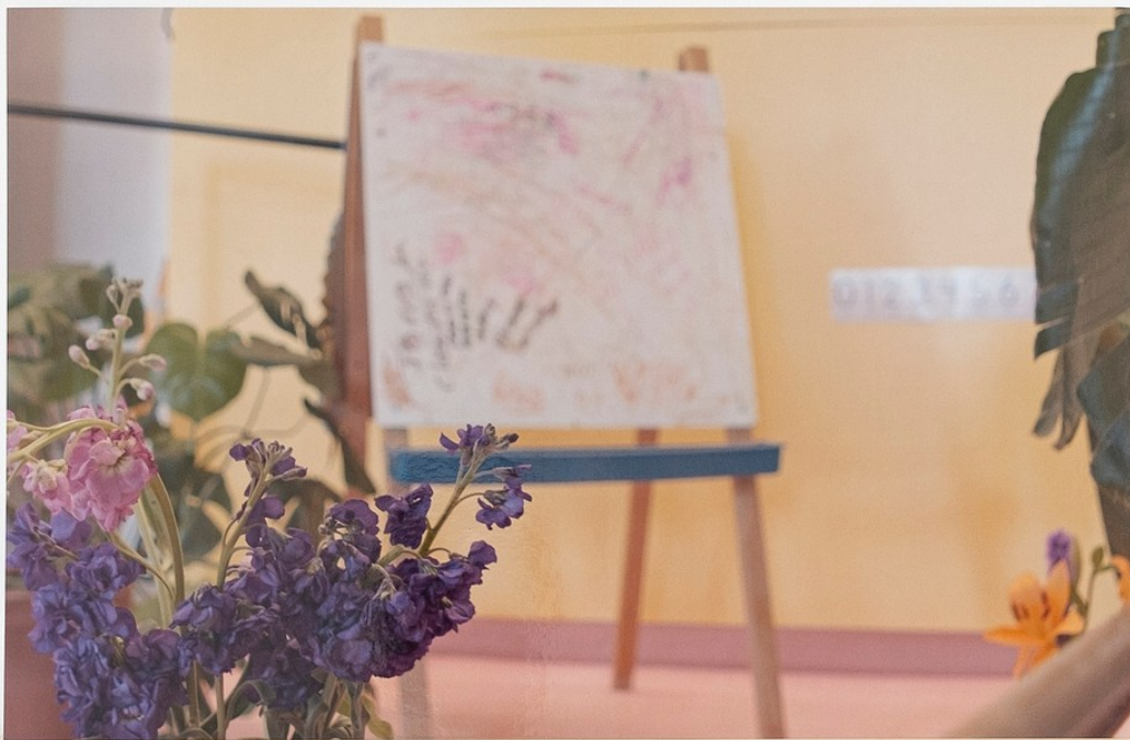
Joe Namy Untitled , 2023 Digital C-Print 20 x 13 inches