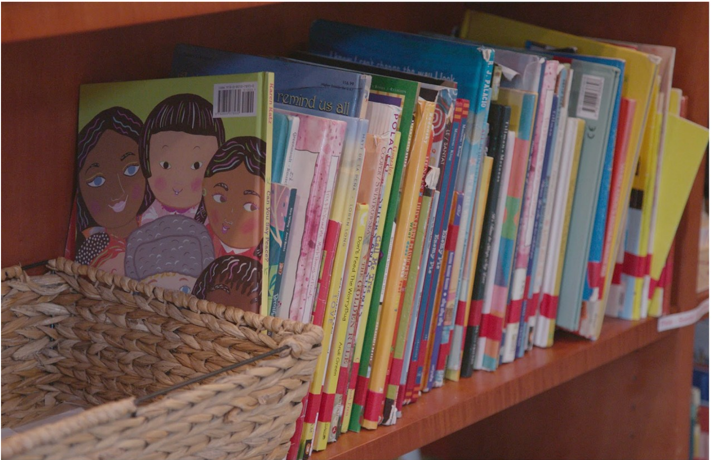
Joe Namy Shelf , 2023 Digital C-Print 20 x 13 inches