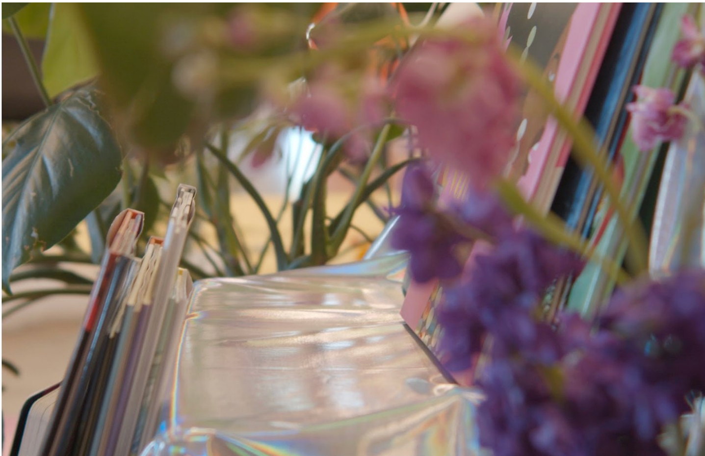
Joe Namy Spines and Stems , 2023 Digital C-Print 20 x 13 inches