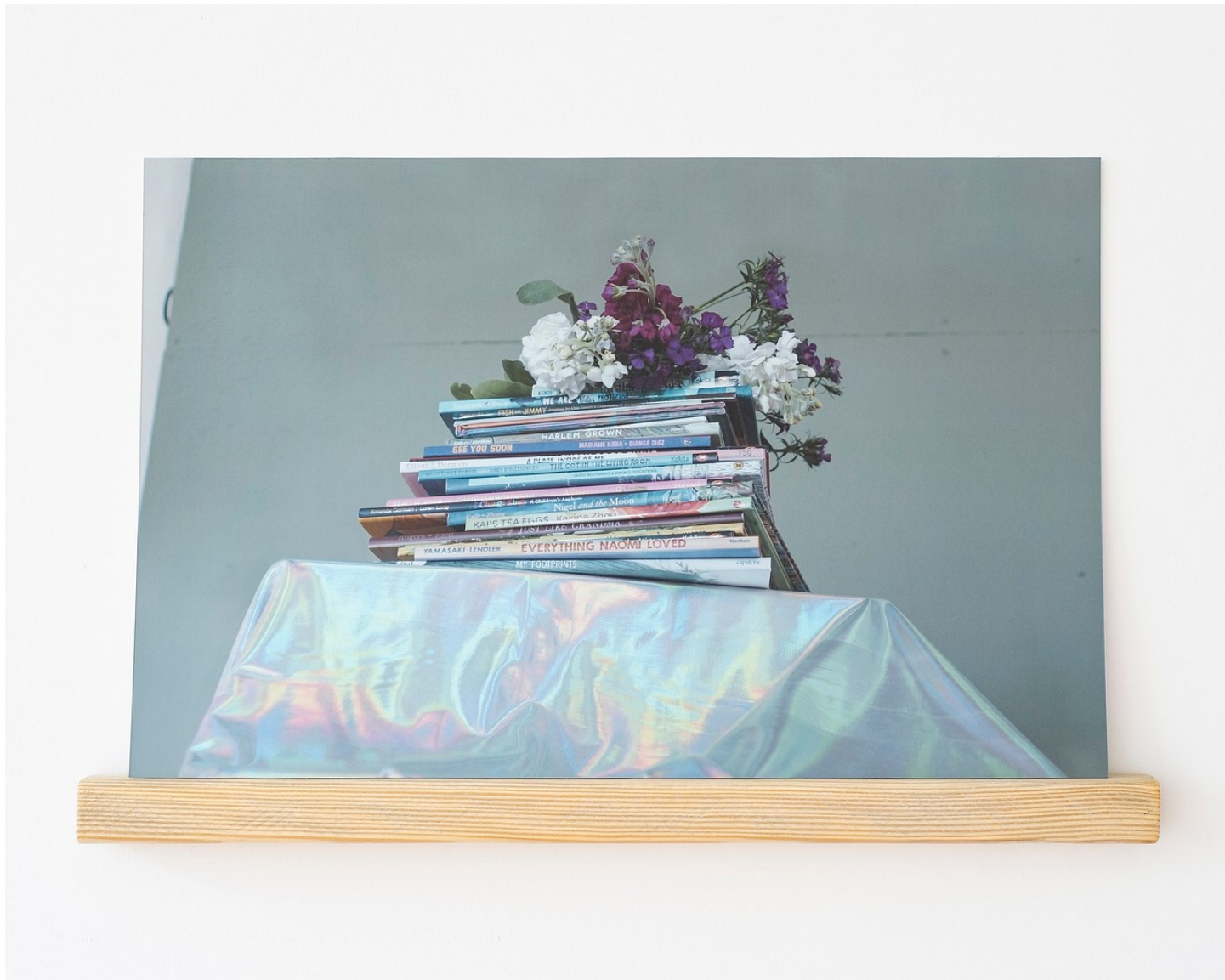
Joe Namy Stacks , 2023 Digital C-Print 20 x 13 inches