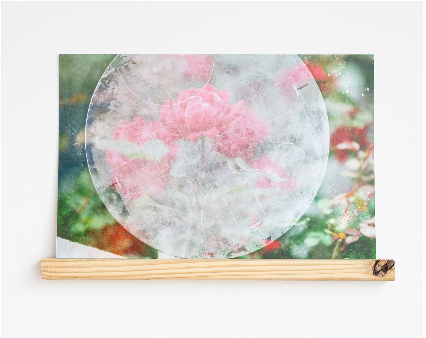
Joe Namy Court , 2023 Digital C-Print 20 x 13 inches