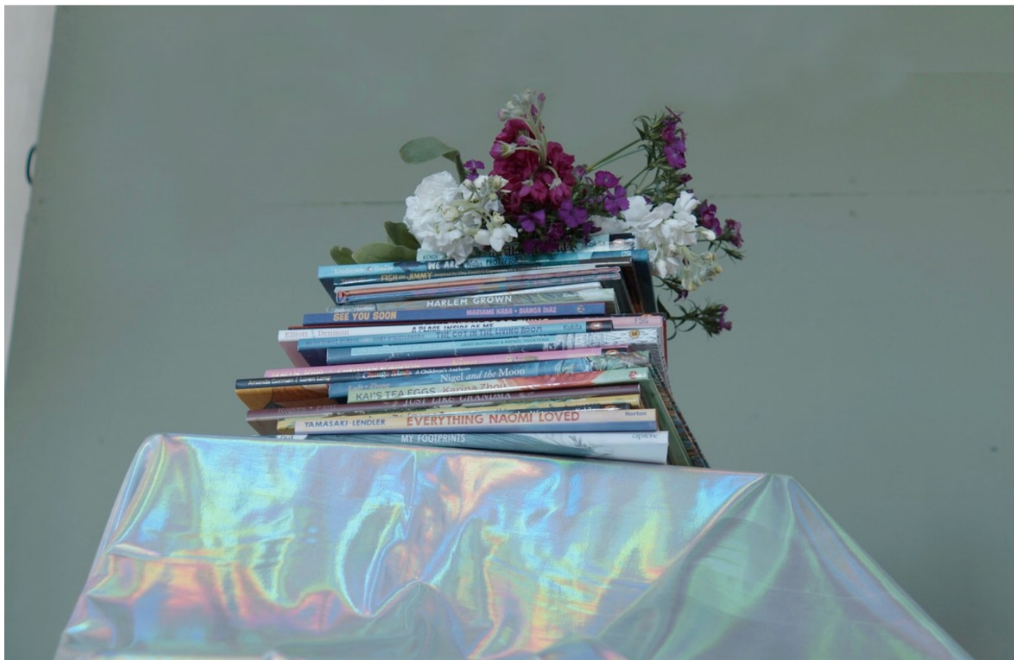
Joe Namy Stacks , 2023 Digital C-Print 20 x 13 inches