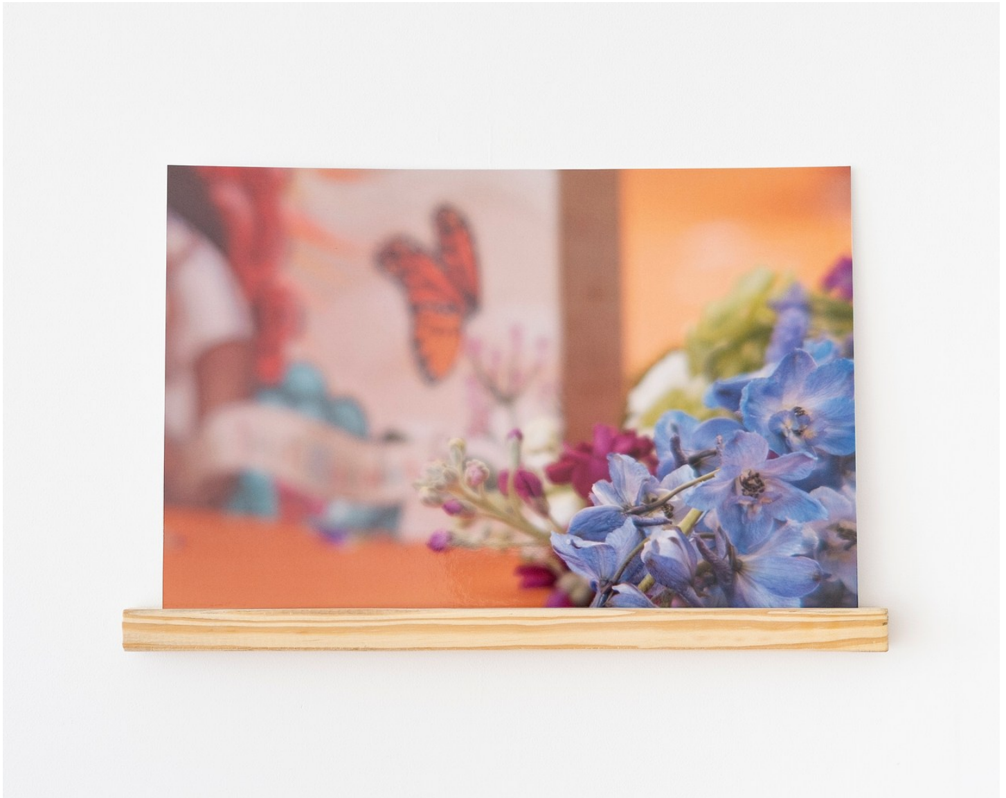
Joe Namy Butterfly , 2023 Digital C-Print 20 x 13 inches