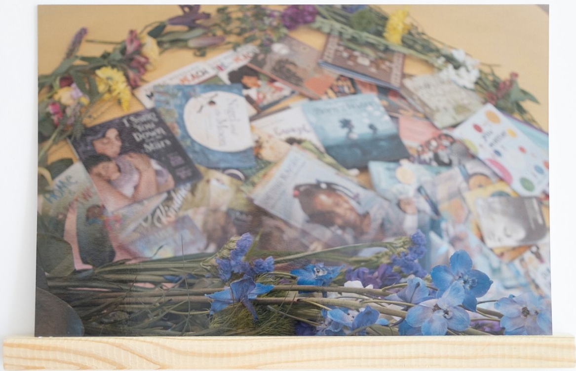
Joe Namy Reading Circle , 2023 Digital C-Print 20 x 13 inches