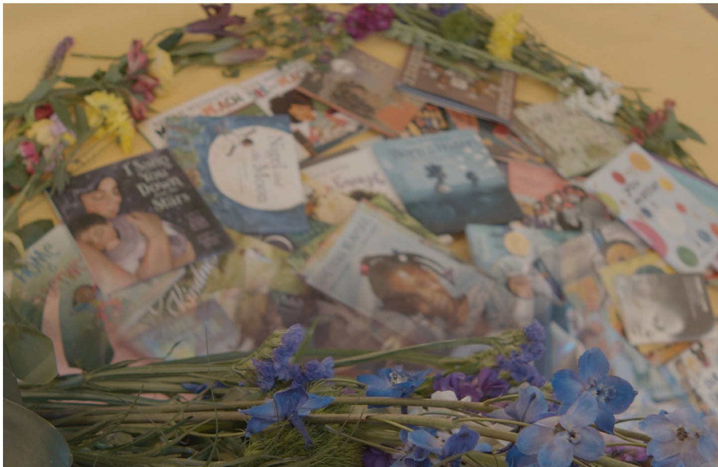
Joe Namy Reading Circle , 2023 Digital C-Print 20 x 13 inches