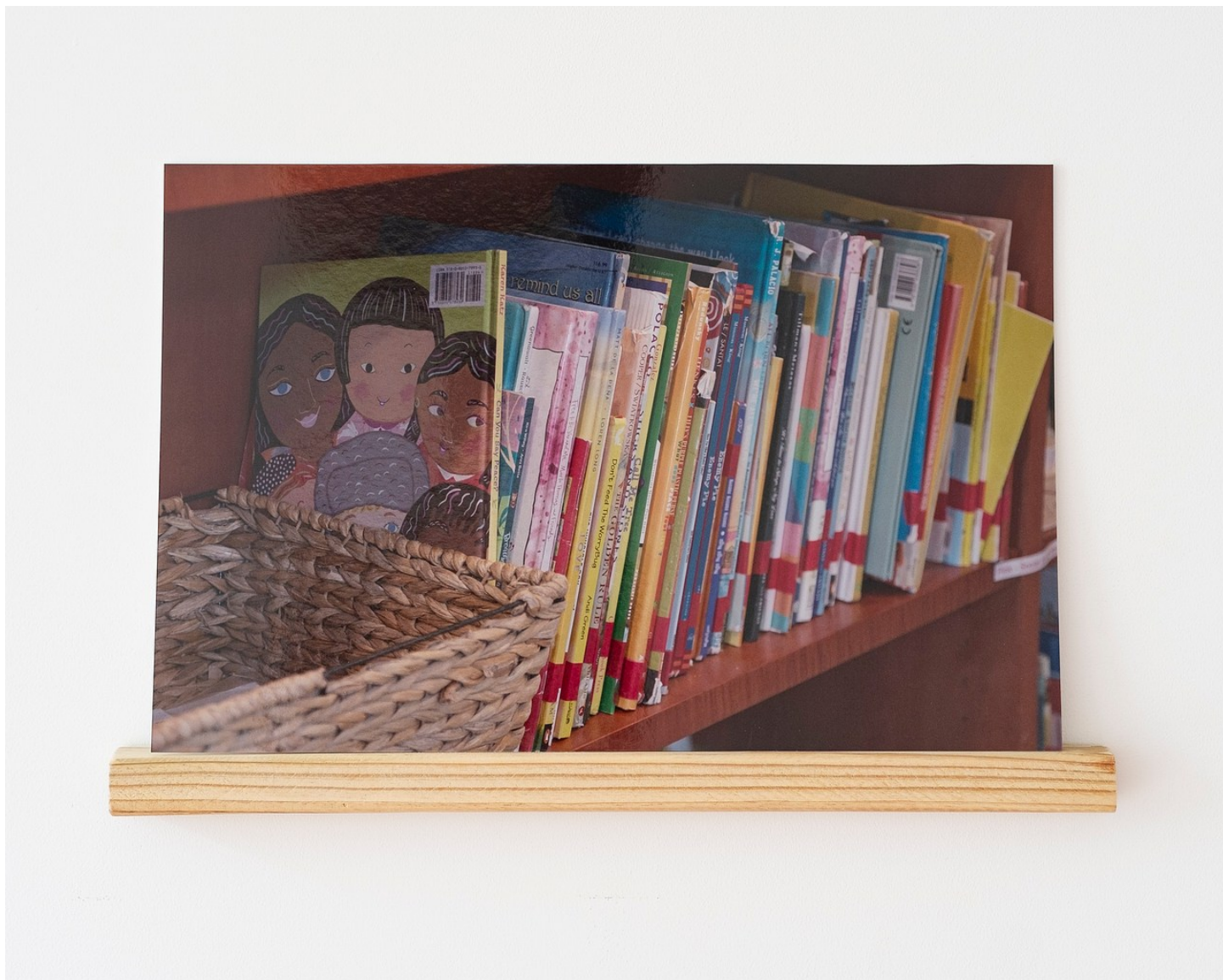
Joe Namy Shelf , 2023 Digital C-Print 20 x 13 inches