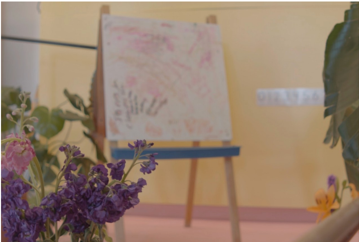
Joe Namy Untitled , 2023 Digital C-Print 20 x 13 inches