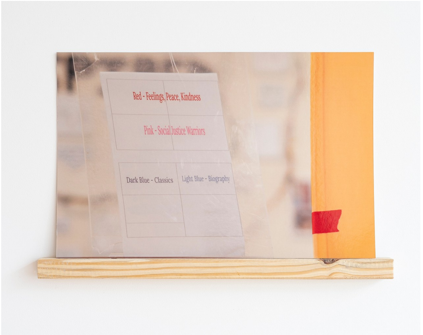
Joe Namy Feelings, Peace, Kindness , 2023 Digital C-Print 20 x 13 inches